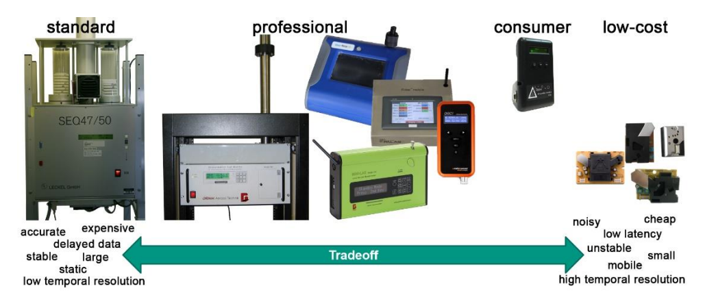
Fig. 1 Instrumentation for particulate matter measurements today covers a wide range and tradeoffs need to be made depending on the application scenario that it is employed for.

Both in industry and academia, alternative PM instrumentation has been developed. Fig. 1 shows a (non-exhaustive) overview of different device classes. Standard equipment uses gravimetric measurement. Professional devices are available that mostly use laser scattering to enable mobile real-time measurements. These devices often include a means of size segregation and generally are still very accurate, some of them even certified by the EPA for official PM measurements. However, they are still prohibitively expensive for dense measurements (tens of thousands of dollars). For participatory citizen science projects that involve individuals, communities and/or researchers, alternatives are needed. Our research therefore focuses on very low-cost commercial off-the-shelf (COTS) sensors, as presented in (Budde, Busse, & Beigl, 2012) and (Budde, Berning, Busse, Miyaki, & Beigl, 2012).