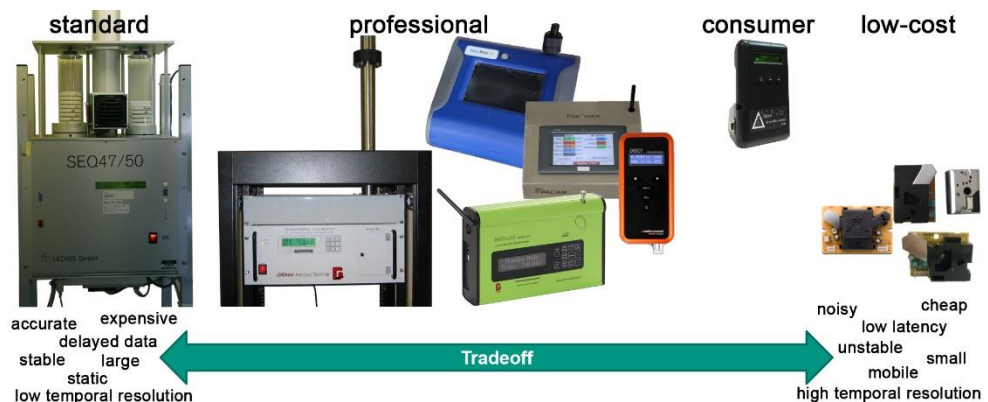
Fig. 1 Instrumentation for particulate matter measurements today covers a wide range and tradeoffs need to be made depending on the application scenario that it is employed for.

Both in industry and academia, alternative PM instrumentation has been developed. Fig. 1 shows a (non-exhaustive) overview of different device classes. Standard equipment uses gravimetric measurement. Professional devices are available that mostly use laser scattering to enable mobile real-time measurements. These devices often include a means of size segregation and generally are still very accurate, some of them even certified by the EPA for official PM measurements. However, they are still prohibitively expensive for dense measurements (tens of thousands of dollars). For participatory citizen science projects that involve individuals, communities and/or researchers, alternatives are needed. Our research therefore focuses on very low-cost commercial off-the-shelf (COTS) sensors, as presented in (Budde, Busse, & Beigl, 2012) and (Budde, Berning, Busse, Miyaki, & Beigl, 2012).