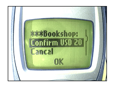
Figure 3. Screen Shot

This would result in a menu being displayed on the mobile phone of the customer (cf. Figure 3 ), and the Internet merchant would have established a relatively secure I/O channel to its customer (or whoever is using the customer's phone).